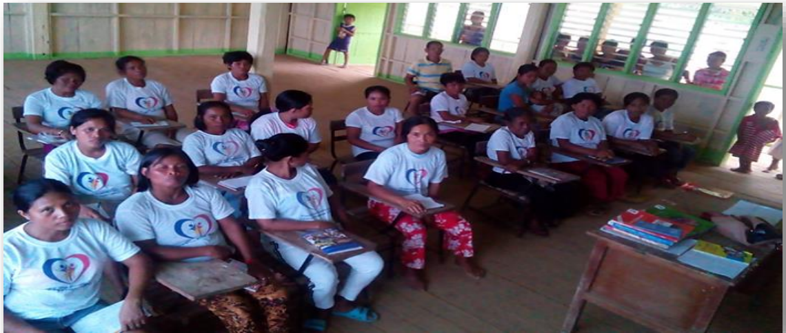
Actual photos taken: Basic Literacy lesson given during Family Development Sessions.

A legacy that cannot be stolen from them for the rest of their lives.